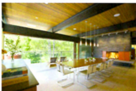
Chapel Hill Residence