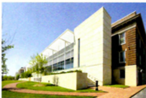
Corporate Headquarters at Old Parkland