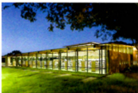
Library in the Park