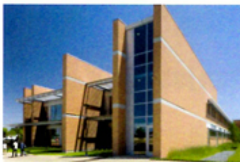
Sabine Hall Science Building